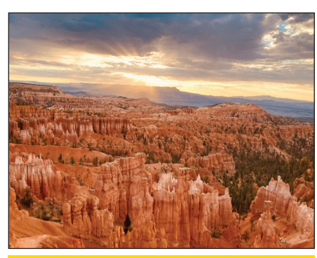
AUGUST Bryce Canyon, UT Laretta Crofts