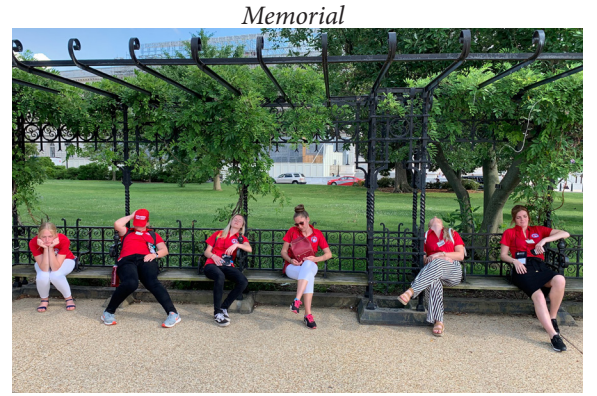
Exhausted after many miles walking the streets of D.C.