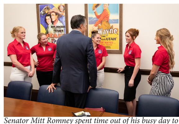
meet with our rural cooperative students.