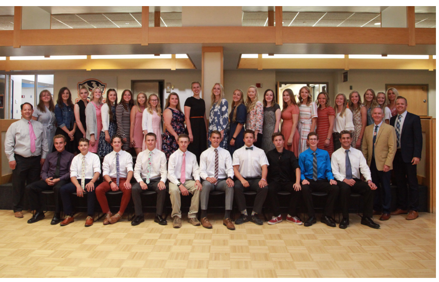
Every once in a while the Garkane group can take things seriously