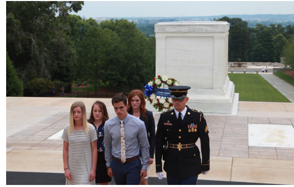
Participating in the wreath laying ceremony at the Tomb of the Unknown Soldier.