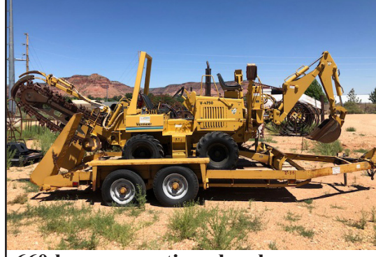
660 hours, new tires, low hours, runs good, double axle trailer included