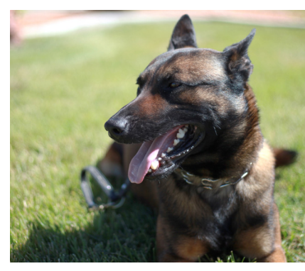
Charger takes a break from training

Thanks to your generous monthly donations, Garkane, through its Operation Roundup program was able to help Kanab City purchase a much-needed K9 dog. The dog's name is Charger and will be a tremendous asset to Kanab and surrounding areas to keep drugs off the street. Kanab city police officer Clint Brinkerhoff approached