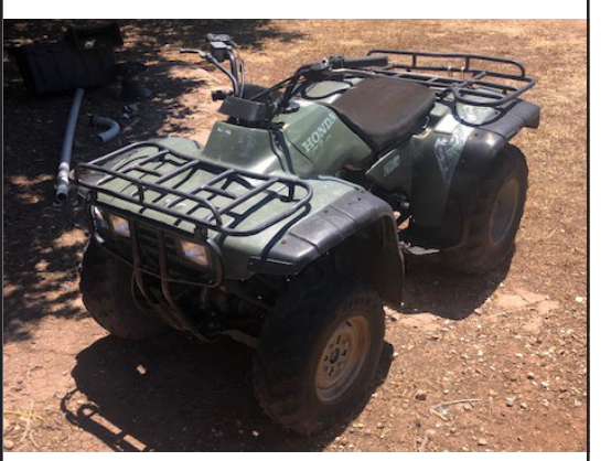
Engine noise, needs work, Located in Kanab