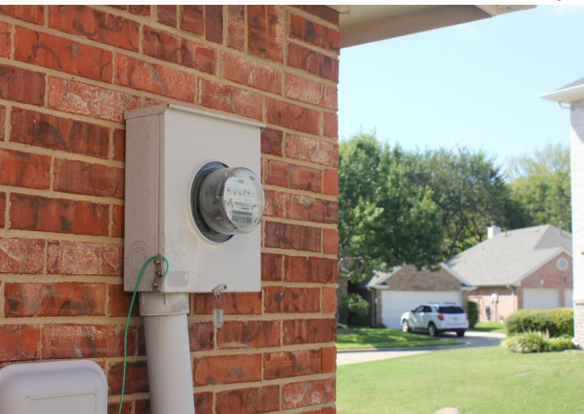
Meter Bases need to be placed in an open accessible area in case of emergency. (not behind fences, enclosures, shrubs, or around animals.)

Every once in a while, Garkane crews will come upon a meter that is enclosed, in a fenced area or proudly protected by a dog. Electric meter bases are the responsibility of the member, but they must be installed in 1 of 4 locations: (117401)