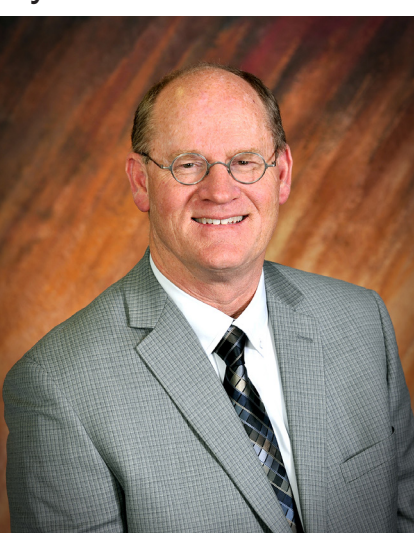
Dear Members of Garkane,

I hope all of our members had a very merry Christmas and a Happy New Year. As I look back on 2019, I am pleased with what the cooperative has been able to accomplish. Garkane employees continue to work hard to serve our members in the most efficient way while keeping costs low, thus equating to lower rates.